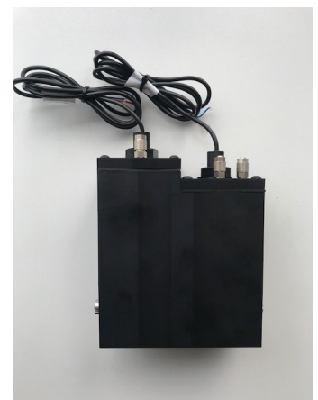
Above left: Single tank option | Above right: Dual tank option