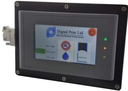
Above: Touchscreen HMI